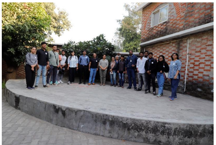
Glimpses from the Laurie Baker Walk