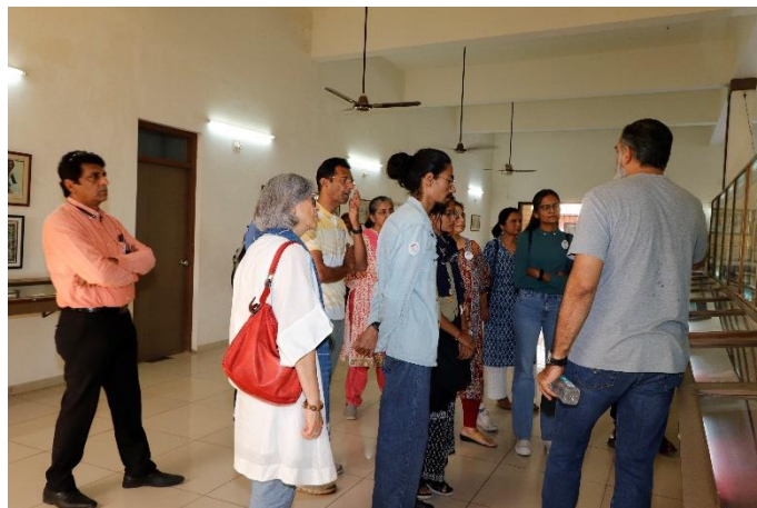
Glimpses from the Coin Museum Walk Through