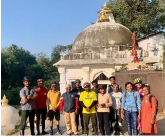
Navnath Cycle Ride