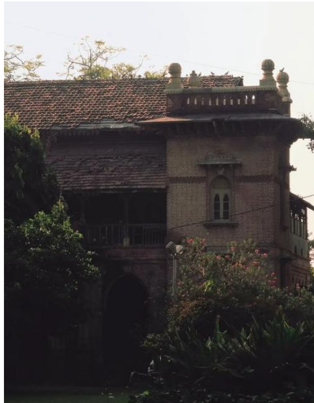
The Jaisingrao Library