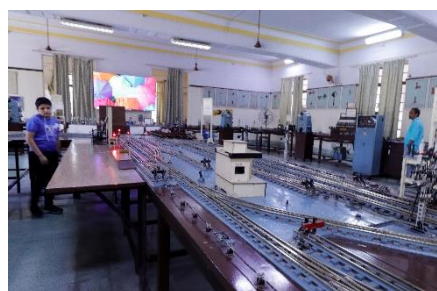
Glimpses from the Railway Model Room Walk Through