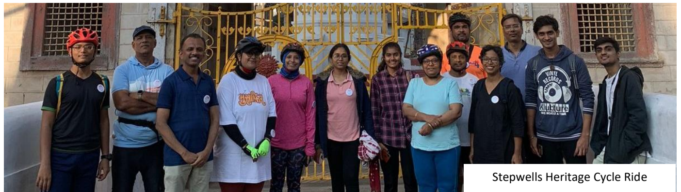
Stepwells Heritage Cycle Ride