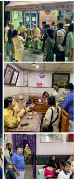
Raopura Retro-Mance Food Walk